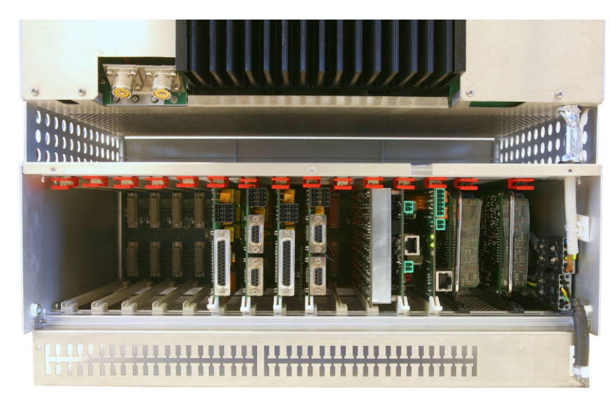
ET9 TOP - WITHOUT COVER